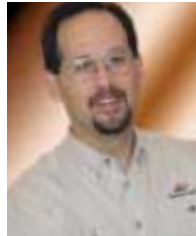
By Vince Bonfanti

Still, we all know of projects (or people) who just won't be motivated to ante up the $1,299 needed to get started with deploying applications on ColdFusion